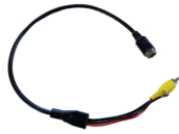
Part Number 3271571 M12-RCA CONVERSION CABLE